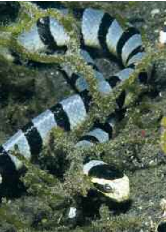
A sleeping seasnake; A yellow jawfish - a tiny fish with the jawline of Arnold Schwarzenegger; An orange scorpionfish, almost completely hidden until the colours show up in torchlight.

The attention to detail at Kungkungan Bay Resort is wonderful. Meals are fully included and available 24 hours. Wifi runs throughout the resort. All cottages are roomy with a lounge, your own balcony and giant bathroom. Diving also comes with a nitrox option and they even think of fresh water for you on the transfer to and from the resort. It all shows careful thought for making your stay as delightful as possible. The prize for best attention to detail though, for me, goes to how they look after your camera equipment. Besides having a very spacious and functional preparation room, each photographer is given a plastic crate of the correct size for your own equipment. During the day it stays within that crate at all times, especially within the rinse tubs. It is loaded onto the dive boat in the crate