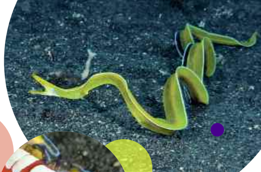
Right: An imperial shrimp gets a free ride on the back of a nudibranch; A yellow ribbon eel out for a swim.