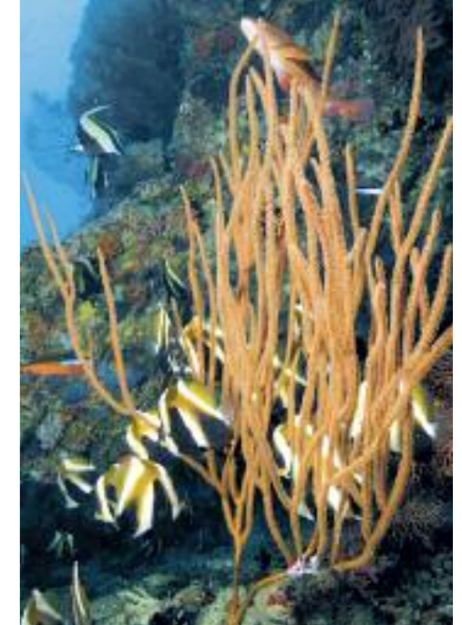
Top to bottom: Bannerfish sheltering within a whip coral; Always incredibly beautiful, gorgonian sea fans; Glassfish swarming about the reef.