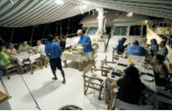
The Maldives Aggressor. Enjoying a balmy evening on deck.