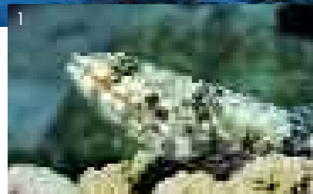
1 A razorfish watches the action on the reef 2 Divers observe manta rays visiting a cleaning station inside the Manihi lagoon 3 The island of Manihi delivers a picture-perfect tropical island experience

station and each morning a dozen or more of these gentle giants converge at this rock-strewn spot seeking relief from their irritating parasites and dead itchy skin with the help of resident butterflyfish and cleaner wrasse. Manta rays by nature are watchful wary creatures. If divers try to minimize their movements and refrain from harassing them, they may get a rare and wonderful opportunity to interact with these magnificent animals up close and personal.