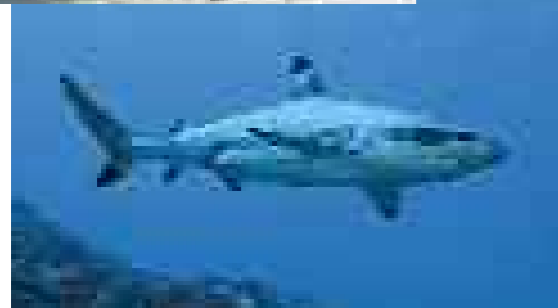
4 Manihi airport terminal 5 A blacktip reef shark patrols the reefs near Manihi 6 Grey reef sharks can be seen near Manihi's passes