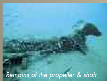
Remains of the propeller & shaft