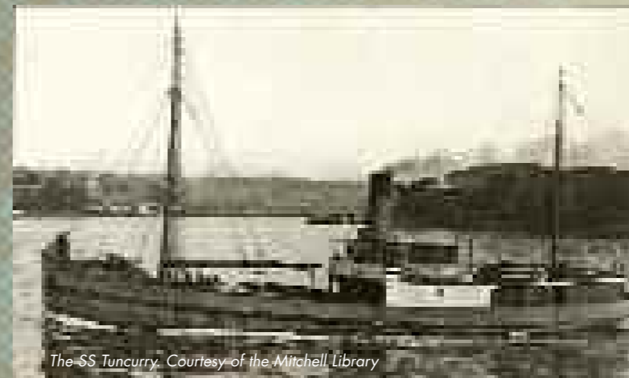
The SS Tuncurry.

The summer and autumn weather have been excellent for diving on the Tuncurry , with good visibility and little or no current. Our dives have been spent exploring, taking video, photographing, sketching the site and enjoying this small but interesting new ship wreck.