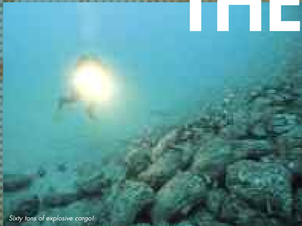
Sixty tons of explosive cargo!