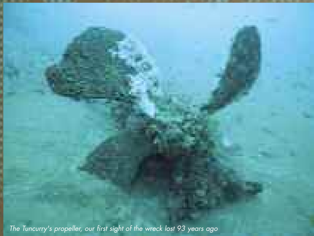
The Tuncurry's propeller, our first sight of the wreck lost 93 years ago