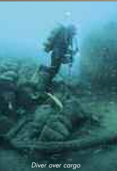
Diver over cargo