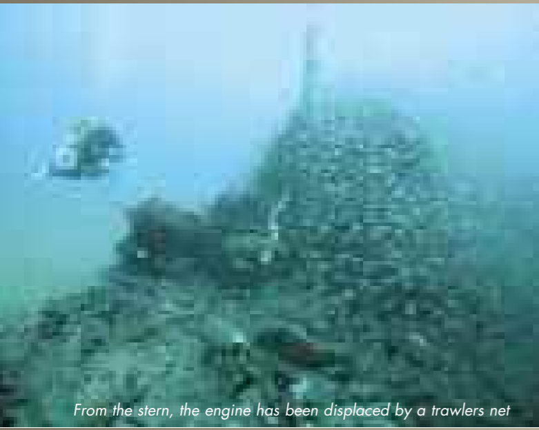
From the stern, the engine has been displaced by a trawlers net