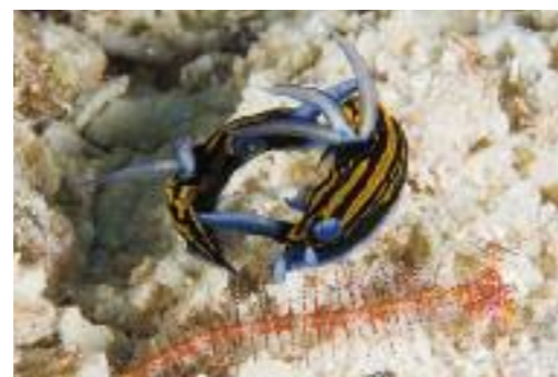
Top to bottom: A group of sharks in 'feed mode'; This hairy ghost pipefish was almost invisible; This octopus was flanked by two cod as it fed amongst the corals; Two tiny nudibranch prepare for courtship.

hours by boat from Suva, the journey is done in comfort. The Island Dancer II crew are all Fijians – without even realising, you are subtly discovering the culture of Fiji. Many an evening would be spent enjoying the balmy weather on the rear deck and on occasion, quietly in the background, one of the crew would pick up a guitar and start singing, then before long another crew member would softly join in. Lose a bit of that western inhibition and you may find yourself singing, smiling and laughing too.