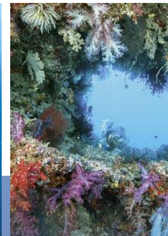
Below left to right: The Island Dancer II at rest, as a luxury yacht she would be equally at home on the French Riviera; Sheer undersea walls and incredible oceanic visibility; The famous 'Window of Dreams'.

airlines or agent for latest schedules and prices. Taxes and Fees: US$15 per person for the cultural village visit and Kava Ceremony. Health & Vaccinations: Fiji is not considered to be a health risk for malaria but there is a very minor risk of dengue in the wetter months when on land so insect repellent is practical. Like all remote locations, tetanus, and hepatitis 'A' & 'B' could be considered. Entry & Exit Requirements: No visa is required for visitors with an Australian passport. Climate: Fiji is a year-round diving