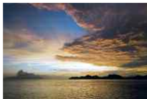
Top to bottom: A plethora of anemones at Hot Rocks; Just one of many nudibranch species on the reefs and sand; A white tip reef shark with signs of bite-marks from mating; Sunset in Komodo.

over the hump you realise instantly that everything you've seen so far is just the appetizer for what awaits now. Quickly hooking on the downward lee slope, again to the left as much possible, brings a milder current flow where you can simply sit back and enjoy the show. Majestic manta rays swim in feeding in the current, at times coming to within an arms reach as they glide and swoop.