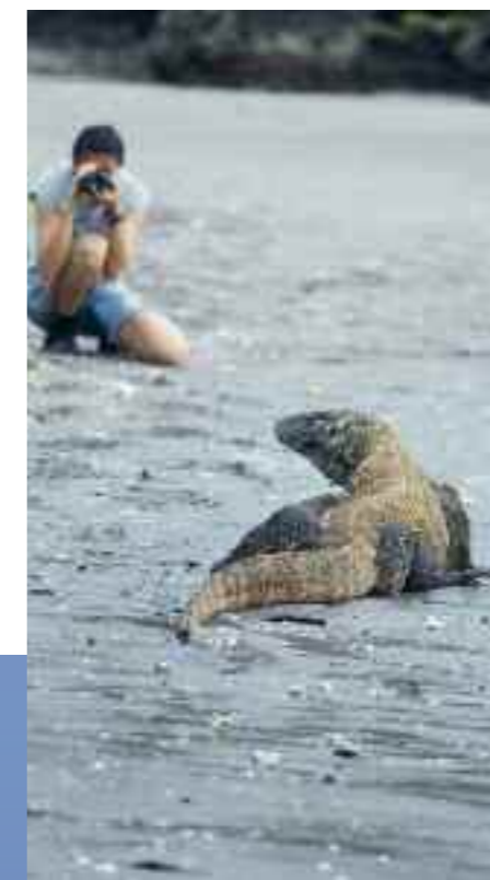
Below left to right: Louise and a Komodo dragon; Strong currents allow for plentiful gorgonians.

can see why. Add to this that they can suddenly run at up to 18km/hr and you feel very glad for the protection indeed. Other excursions include hikes up to the top of island peaks to witness spectacular island vistas and a pink beach, where a red coral that does not lose its colour has eroded into fine granules and then when mixed with white sand, it manifests as a wonderful pink hued beach. Komodo truly is a destination to appreciate below AND above the waves and I am definitely looking forward to a return visit.