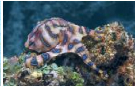
A highly venomous blue ringed octopus at Fish Rock.

but the wind and current were back. After four brilliant dives at Fish Rock we were reluctant to pack up gear and hit the road. It had been a fabulous two days, and I was leaving with some of the best memories and images of grey nurse sharks I've had in over 25 years of diving with these impressive sharks.