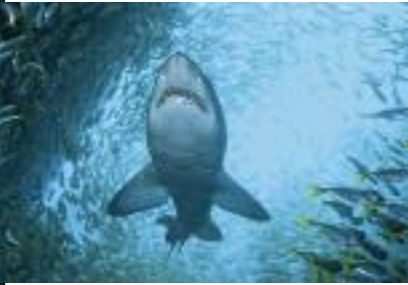
A grey nurse in Fish Rock Cave surrounded by schools of bullseyes.