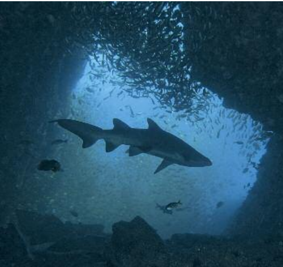
Below: A lone grey nurse shark silhouetted in the shallow end of Fish Rock Cave. Right: A thick school of bronze bullseyes almost obscures the shallow end of the cave; One of the watchdogs of Fish Rock Cave, a large banded wobbegong shark; A resident green moray eel.