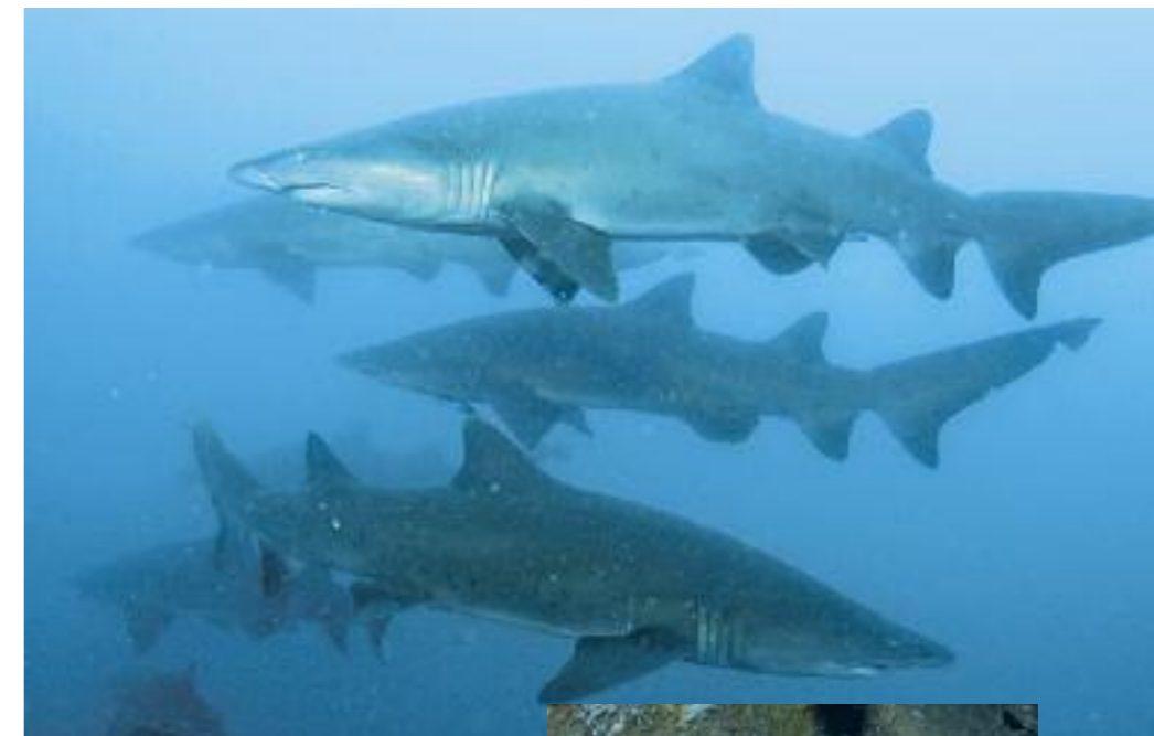
Right: A group of grey nurse sharks at The Pinnacle; Herbert, the resident hawksbill turtle, searching for a meal in the cave; A giant cuttlefish shelters under a ledge.

30m to 9m, but we stayed above 21m where the clear water was and all the action. Swimming north we encountered several blue gropers and more wobbies before we reached wall-to-wall sharks. Patrolling the western side of The Pinnacle was at least 20 grey nurse, including some very large females 3m long.