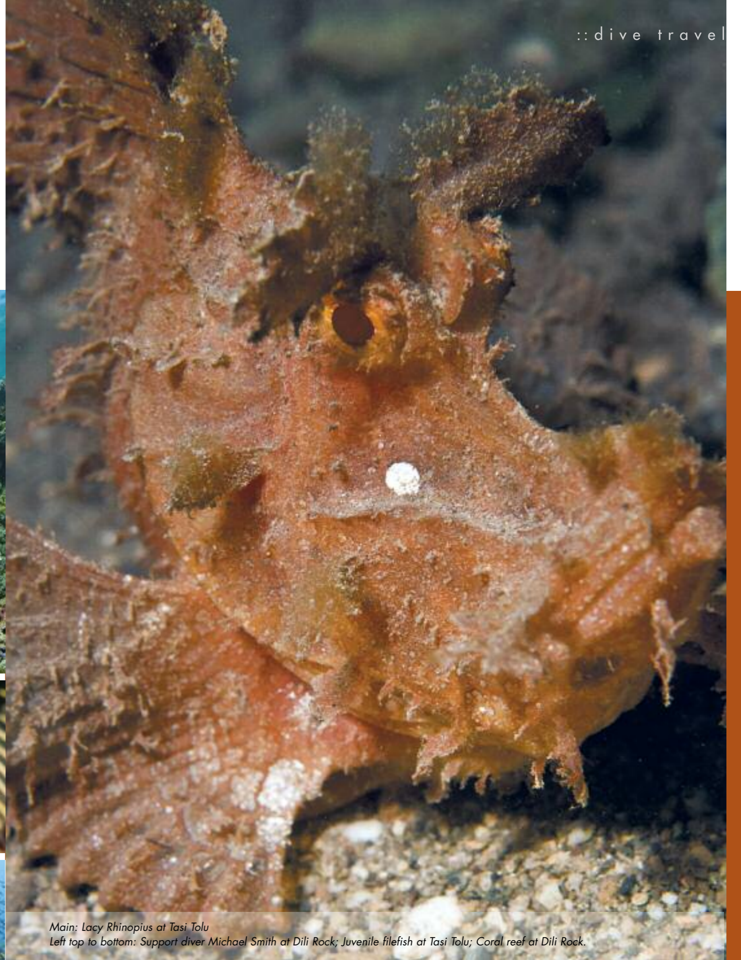
Main: Lacy Rhinopius at Tasi Tolu