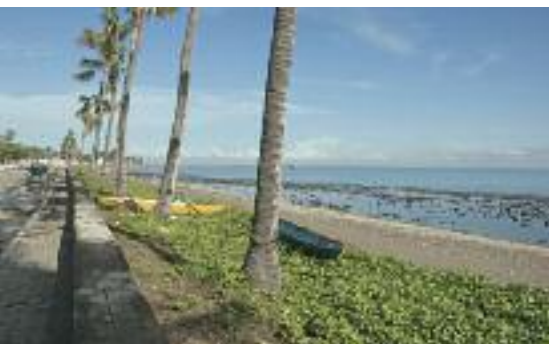
Top: Christmas tree worm. Bottom: Esplanade of Dili.